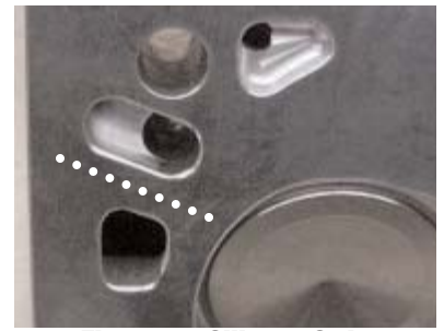
Figure 1 - Silicone Strip